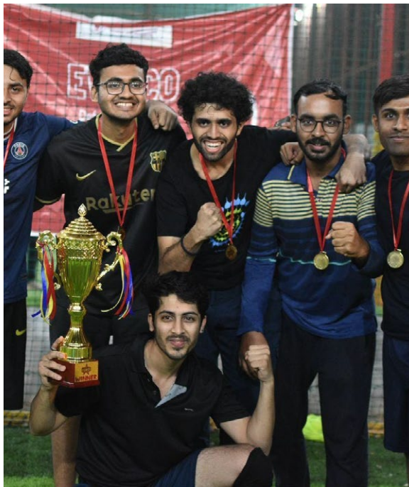
FOOTBALL WINNER (MUMBAI CITY FC)